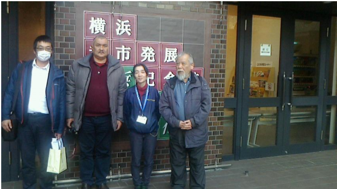
February 11 : Visit to the Ancient Orient Museum, Tokyo